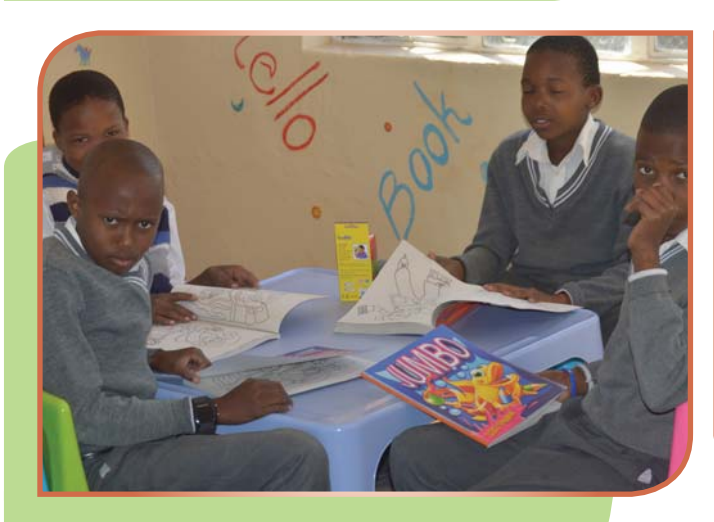
Some of the Primary class students admiring some of the teaching aids donated to the Pre School

In an effort to create awareness about the establishment of BHC as a single housing authority, SHHA issues, Public Officers Housing Initiatives and the on-going sitting tenants' campaign, the corporation recently took part at the Vision 2016 awareness month launch at Kalkfontein village in Ghanzi District.