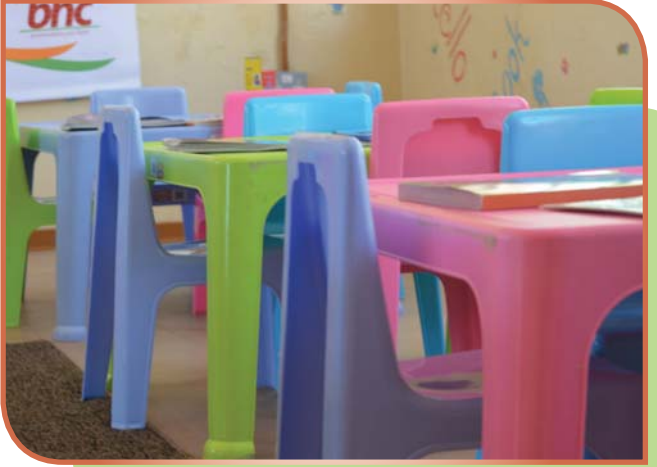
Part of the donation given to Kalfonten Pre School

The Vision Awareness month has been commemorated for the past 8 years in different parts of the country as a way of reminding citizens of the vision for the actualisation of its ideals. This year's Vision 2016