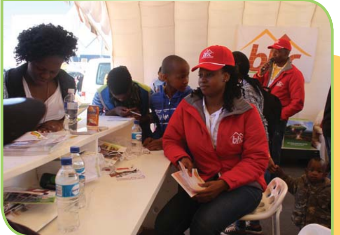
Bhc staff interacting with customers at the fair

The turn up was satisfactory as the BHC stall saw a large number of people coming in to get the information about the campaign, as well as to enquire and get clarity on the issues around the mandate. Through this campaign BHC is giving valid leased tenant the chance to own property in prime land excluding town houses and flats.