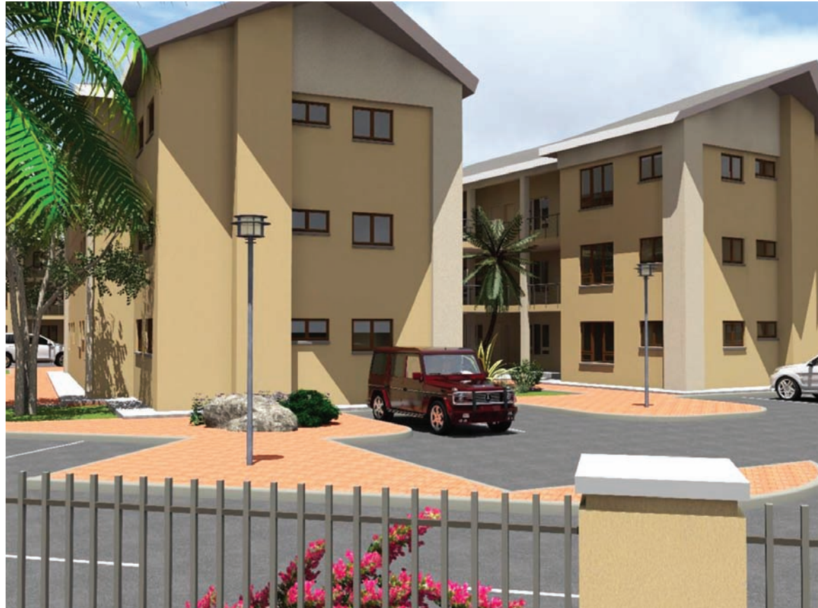
The Youth Housing programme apartments have two bedrooms, ceramic tiles, fitted kitchen and common bathroom.